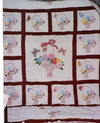
"Basket of Flowers"