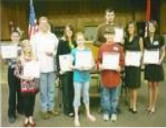
Good Citizenship Awards