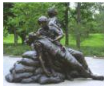
Vietnam Womans. Memorial